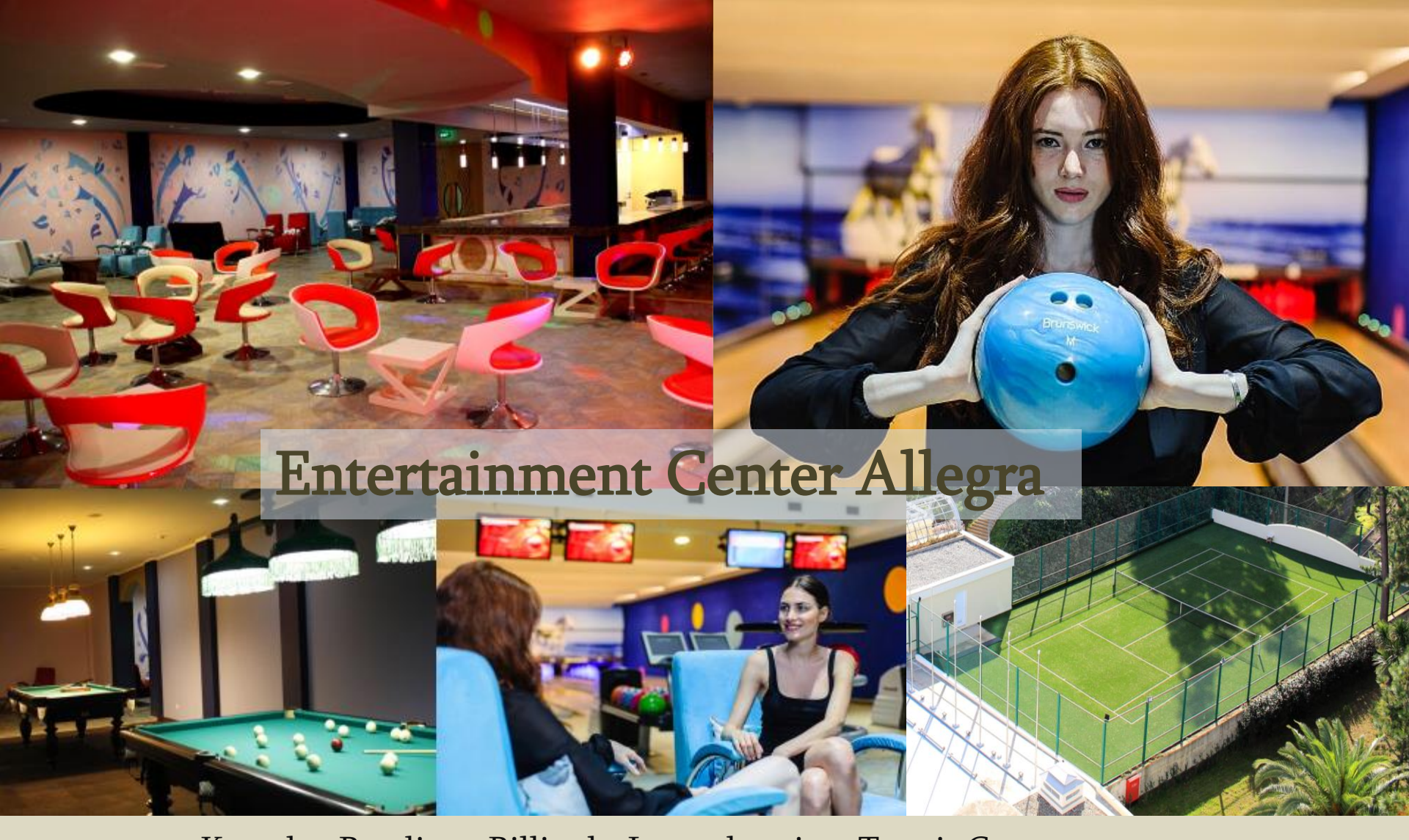
Karaoke; Bowling; Billiards; Laser shooting, Tennis Courts