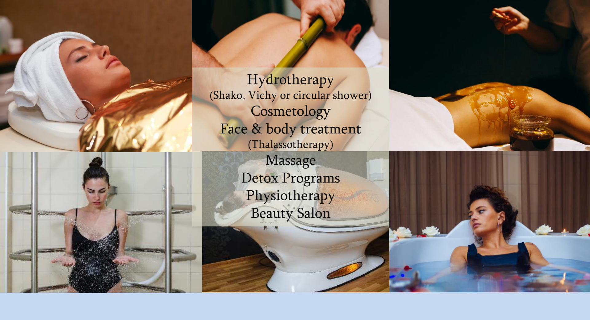
Otium Spa is equipped with ultra modern technologies, which can effectively solve problems related to excess weight, cellulite, detoxification, face and body care.